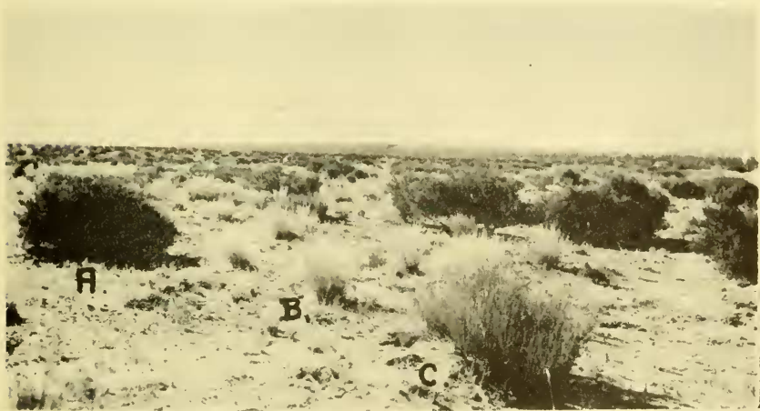
Figure 8. Desert near Coyote Gulch. Showing the grass Aristida longisetia (B) in association with Colcogyne (A) and Ephedra torreyana (C).